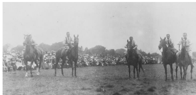
The future Sports Ground site had earlier served as venue for the annual Tonbridge Races

Lord Hardinge said he saw no reason why this magnificent land should not become the finest sports ground in the country. He declared the grounds open and dedicated them to the public for ever.