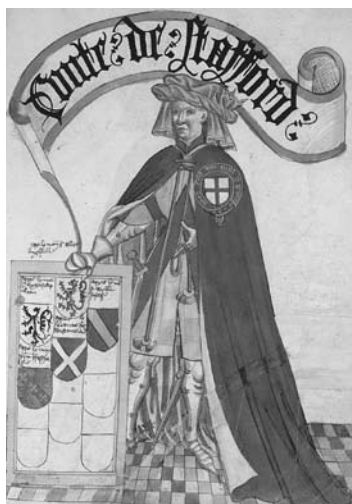
Ralph Stafford in the Garter Book