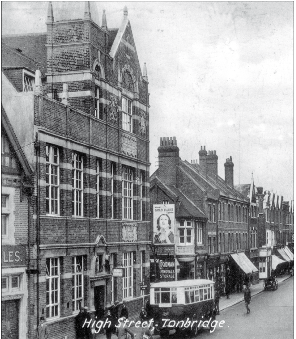
The Library and Technical Institute in the 1930s. See page 6.