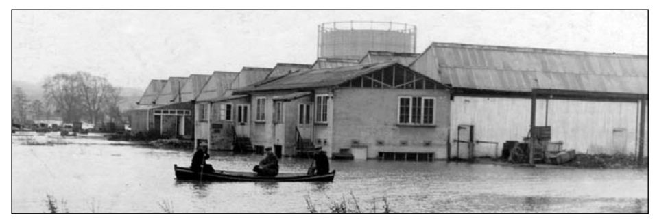
Probably the remains of the derelict Storey Motors factory near Cannon Lane, photographed during a flood, with the gasworks behind.

Storey Motors was the victim not just of a lack of housing in Tonbridge, but also a sudden economic downturn which seriously reduced demand for up-market cars. By then, according to Wikipedia, 1000 Storey cars had been built in Tonbridge. It would be nice to know if any still survive.